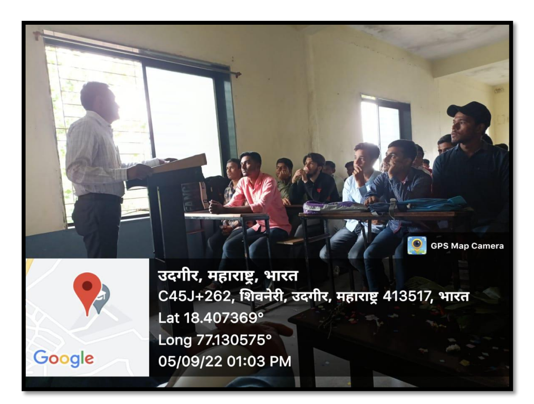
Teacher's Day Celebrated by Students in the Classroom