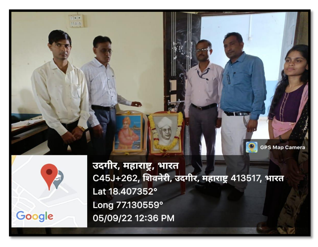
Teacher's Day Celebrated by Students in the Classroom