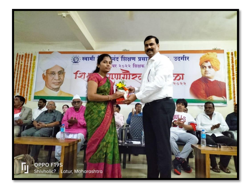
Teachers Appreciation Ceremony