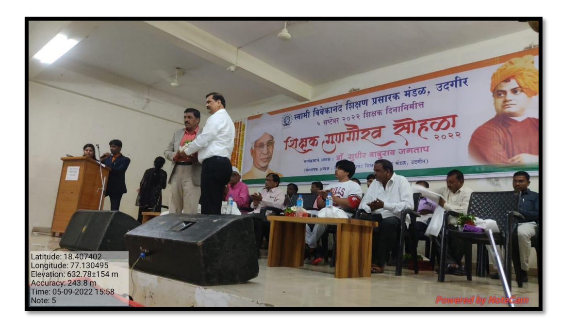
Teachers Appreciation Ceremony