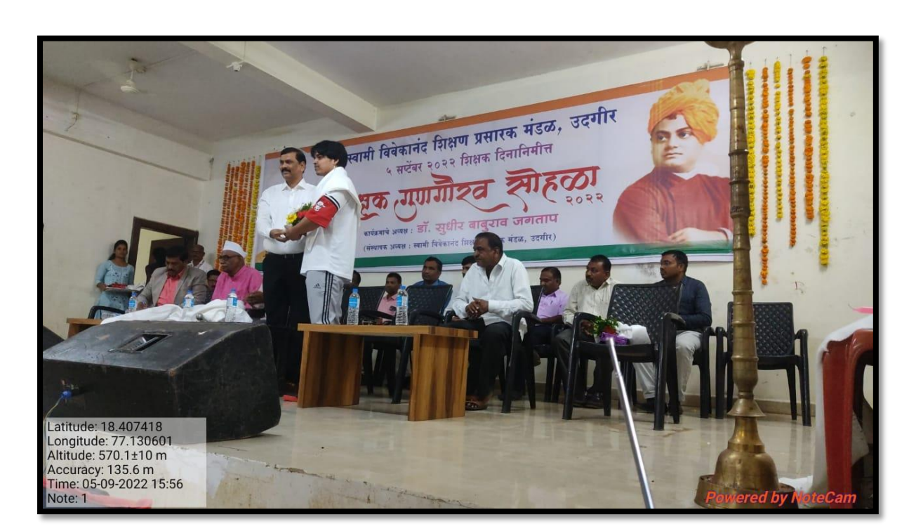
Teachers Appreciation Ceremony