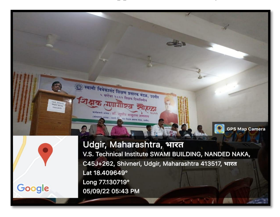
Teachers Appreciation Ceremony