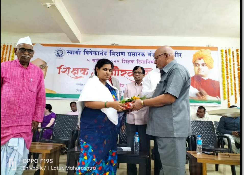
Teachers Appreciation Ceremony