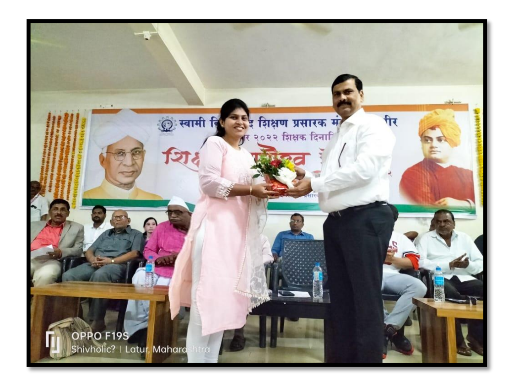
Teachers Appreciation Ceremony